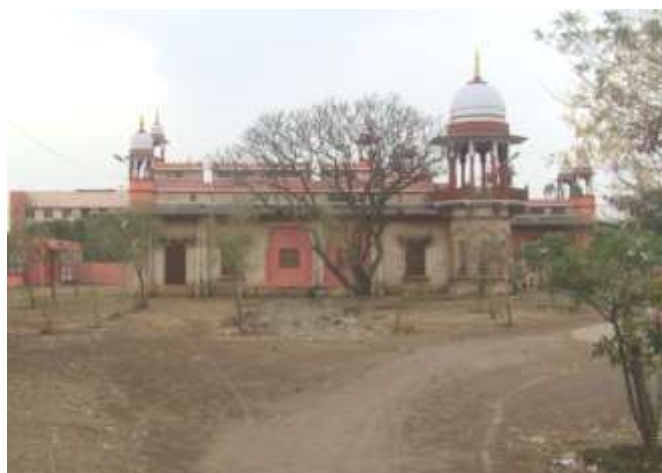
Site A - College campus