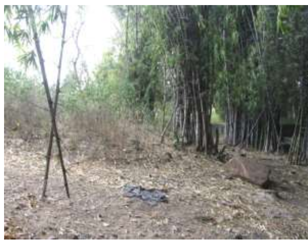
Site B – Jhiri area